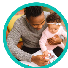
Paid family leave for parents and guardians